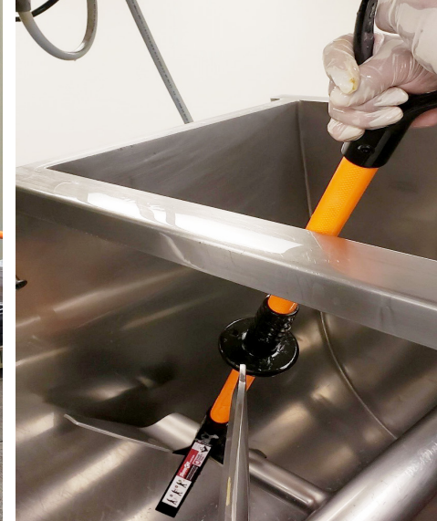
Use the Shovelt® to push objects where potential hazards exist such as rotary equipment and auger fins.