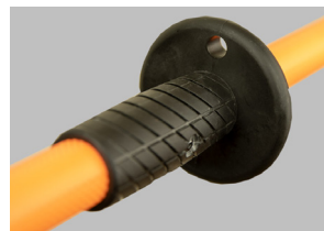
Hand Guard With Tethering Point