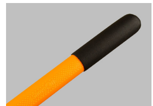
Rubber End Grip