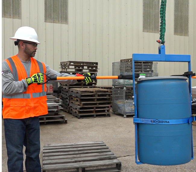
Effectively work within a safe distance of objects that may cause hand, arm, foot and even full body injuries.

The Shovelt® helps workers avoid costly hand injuries while working with suspended loads or maneuvering objects, maintaining proper body positioning for safe handling out of the line of fire. It enables users to guide loads, move and position pipes and tubulars, as well as grab slings and tag lines without physically placing hands on the item.