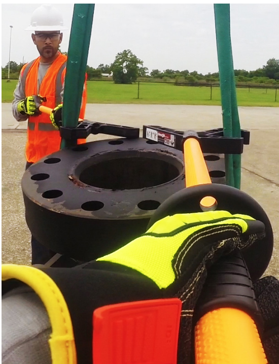
Opposing grab hooks help maneuver cable slung loads. The textured shaft and hand guards provide slip resistant handling to keep hands in place.