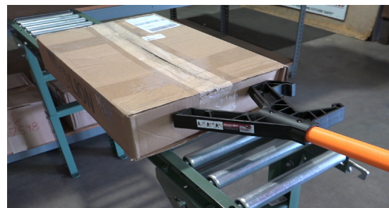
Use for a variety of tasks where "no touch" is required.