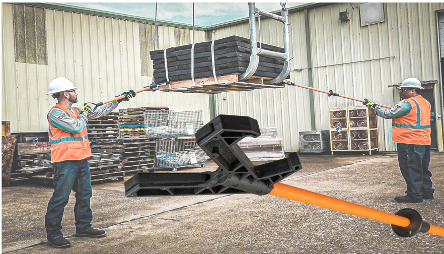
The versatile V-shaped head allows workers to safely push and pull against flat surfaces, corners and tubulars.