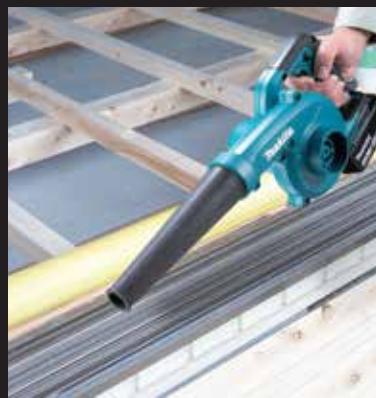
For blowing dust in the sash