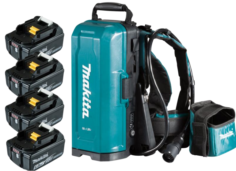
2.8 times more runtime