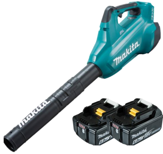
5.6 times more runtime