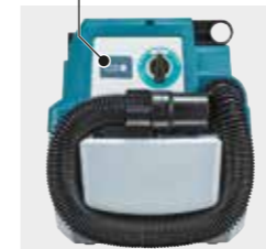
Hose can be stored